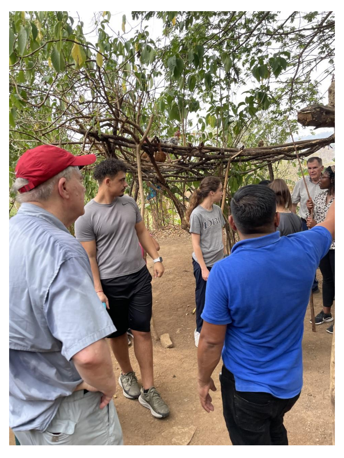
Volunteers gather together for a debriefing before venturing into the community to assist locals